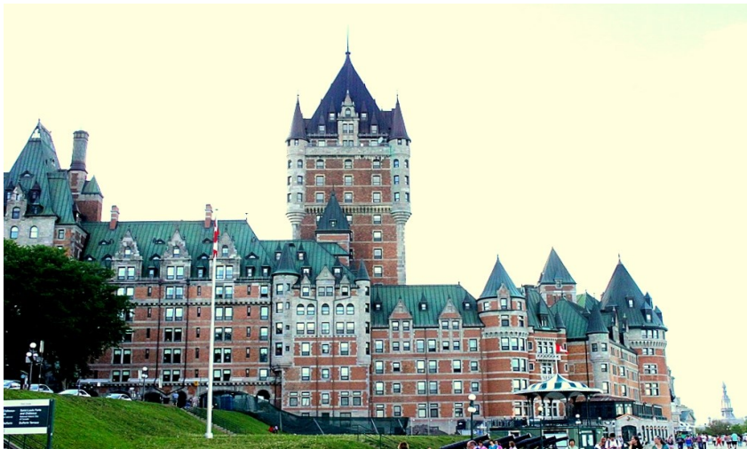
The Getaway Guide | Summer 2014

OBJECTIVE: Book a cruise aboard Holland America Line's ms Veendam and enjoy a scenic itinerary that treats passengers to international and domestic delights